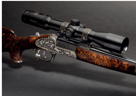
A Scheiring bergstutzen, Ferlach, with Zeiss scope Lot 351, Starting price € 6.600