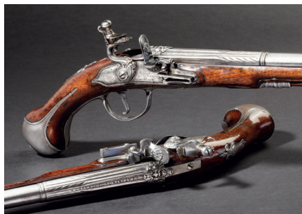
A pair of flintlock rifle, J. Steinweg, Munich, ca. 1690 Lot 102, Starting price € 3.800

The various objects are being offered for auction at the prices stated above. A premium amounting to 25% (incl. VAT) will be added to the final hammer price.