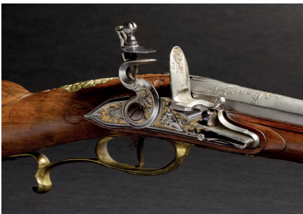
A deluxe flintlock rifle, Vienna, circa 1730/40 Lot 63, Starting price € 8.500