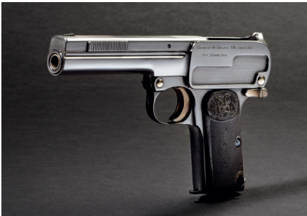
A Dreyse Mod. 1910, locked, prototype Lot 475, Starting price € 8.000