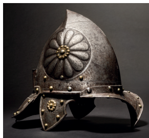
A French/Italian burgonet, circa 1600 Lot 3597, Starting price € 7.500