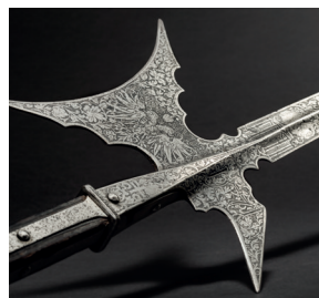
A German etched halberd for the trabant guard of Emperor Maximilian II, Augsburg, dated 1571 Lot 3665, Starting price € 10.000