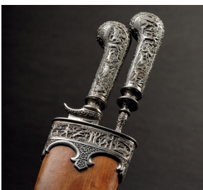
A set of Fuhrmann hunting cutlery, J. Batsche, Vienna, circa 1880 Lot 3723, Starting price € 3.500