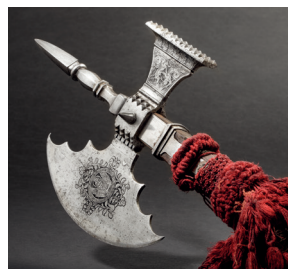
An Italian etched pole axe for parade, Venetia, ca. 1500-10 Lot 3658, Starting price € 15.000

Copie permitted – please send proof to: Hermann Historica GmbH Marketing Department Bretonischer Ring 3 85630 Grasbrunn / Munich DEUTSCHLAND