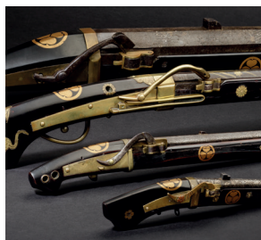
From our group of 14 superlative Japanese firearms. Lots 3469 - 3482