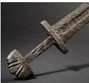
A Northern European viking sword with INGELRI blade, 10th century Lot 3724, Starting price € 18.000