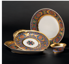
Porcelain from the Gothic service, Imperial Porcelain Manufactory St. Petersburg, reign of Tsar Nicholas I, ca. 1833/40