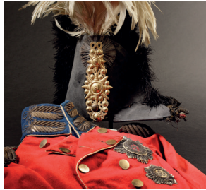
King Frederick VI of Denmark, Duke of Saxe-Lauenburg - a general's uniform, ca. 1814/20