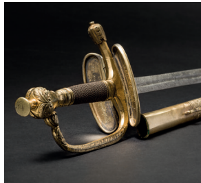
A rare officer's dagger M 1798 of the Russian infantry, with engravings of the officers' names