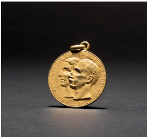
A gold medal to commemorate the wedding of Princess Giovanna to Tsar Boris III of Bulgaria in Assisi in 1930