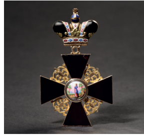
A Russian St. Anna order, a Cross 1st Class with Swords, dated 1867.