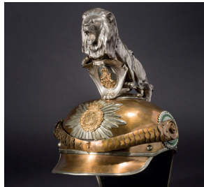
An M 1907 helmet for enlisted men of the Gardereiter-Regiment