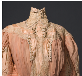
Empress Elisabeth of Austria - a two-piece summer dress in salmon pink from Corfu