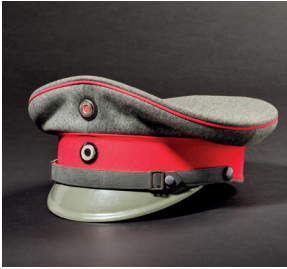
Emperor Wilhelm II - his personal visor cap to his field grey uniform, ca. 1915