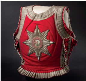
A supravest for officers of the Garde du Corps, in the issue of circa 1860