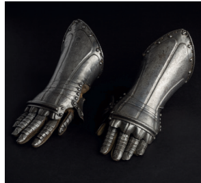
A pair of gauntlets with the original leather gloves, Nuremberg, circa 1580