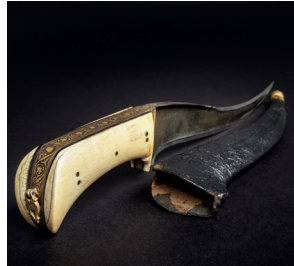
A Persian gold-inlaid pesh kabz, 1st half of the 19th century