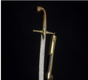
A deluxe Ottoman shamshir with gilt mounts and diamond-studded guard, circa 1830