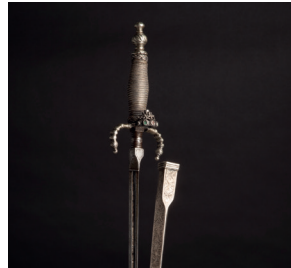
A Venetian silver-mounted dagger, dated 1767