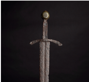
A French mediaeval sword with brass pommel, circa 1350