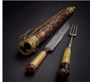
A distinguished set of German cutlery with amber knobs, probably Koenigsberg, 2nd half of the 17th century