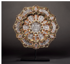
A magnificent ornamental plate with marks for Hermann Ratzersdorfer, Vienna, 19th century