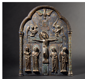
A large champlevé picture panel in the style of the 12th/13th century, Limoges