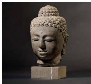
A large Buddha head of volcanic rock, Borobudur, Java, 9th century