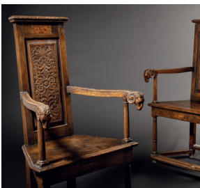
A pair of French Renaissance armchairs, Loire valley, 2nd half of the 16th century