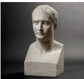
A spectacular French bust of Napoléon Bonaparte of Carrara marble, early 19th century