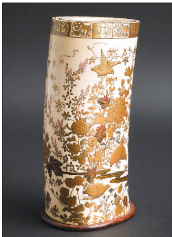
Japanese gold lacquer elephant tusk brush pot, Meiji period.