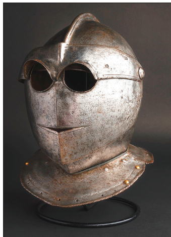
Northern Italian Savoyard type "Death's head" helmet, circa 1600.