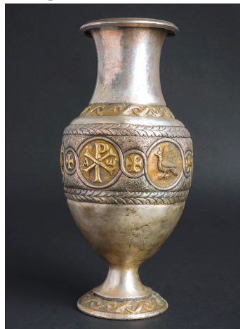
Early Christian gilt silver vase, Fifth to Sixth Centuries.