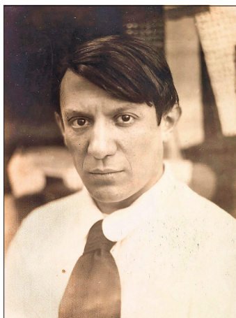
"Pablo Picasso in Paris" by Georges de Zayas, circa 1915.

The Palais de la Porte Dorée is at 293 Avenue Daumesnil. For information, https://www.palais-portedorée.fr/en